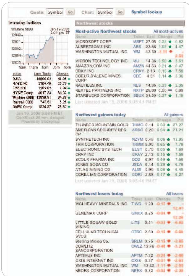
Major market indices and local watch lists