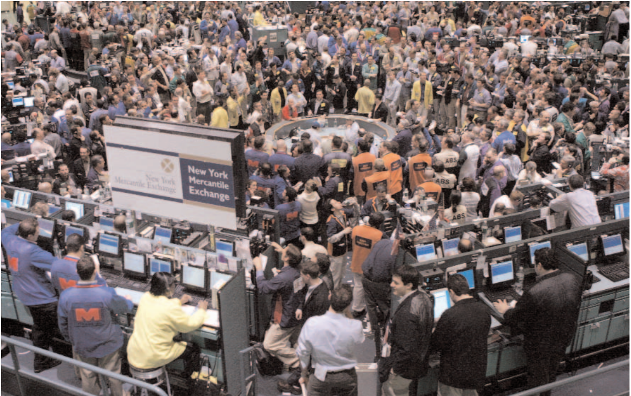
NEW YORK/Jan. 2006 | Traders work in the crude oil futures pit at the New York Mercantile Exchange. Crude oil prices spiked on concerns of supply snags.

AP Financial Tools is a hosted, turnkey service that adds tools for viewing personalized market and financial information on your Web site. AP Financial Tools builds online readership, traffic and advertising opportunities on a high-interest topic.